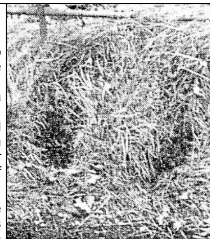
The footmarks at Overton