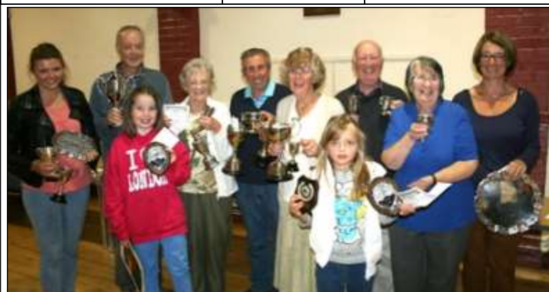
more photos on page 6