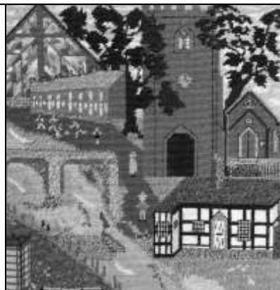
The Overton village panel

We all owe Corinne a big debt of gratitude for guiding us in this project and for doing the lion's share of the work. Also many thanks to all the other stitchers.