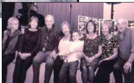
1963 and 2013 (with a small intruder)

Hope House Hospice. They wish to thank all those who gave so generously and made the evening so special.