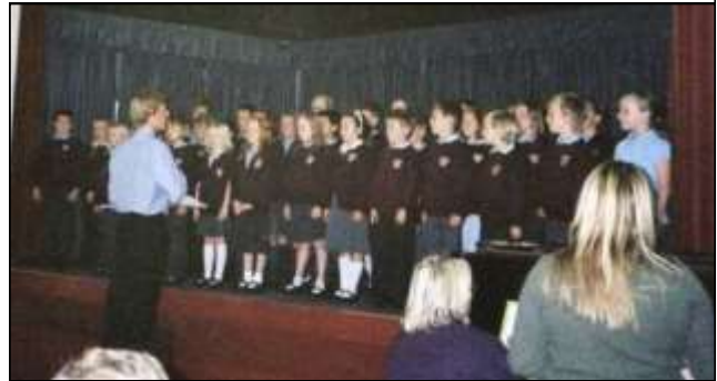
St Mary's School Choir entertains at the Harvest Supper