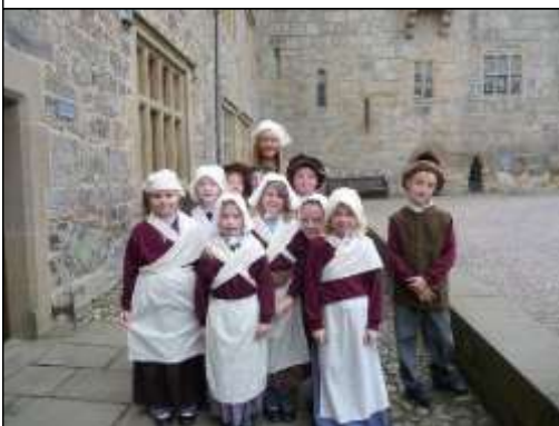
Pupils from St. Mary's during a school visit to Chirk Castle

Overton will look forward to a host of golden daffodils in the Spring. The Community Council has acquired 100 kilos of daffodil bulbs. Children from St Mary's School helped Community Councillors plant some of them around Parkside. They will plant more around the school.