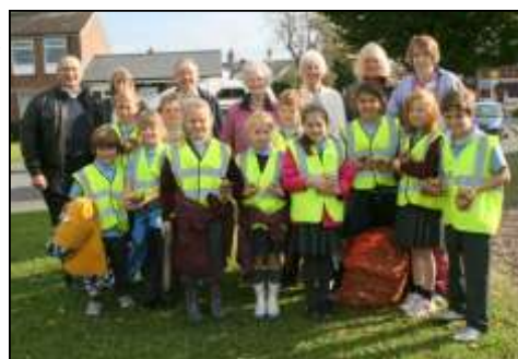
Pupils from St. Mary's, Community Councillors & residents of Parkside

Children from the school have also visited Chirk Castle in October to spend a day finding out what it was like to live there in Tudor times.