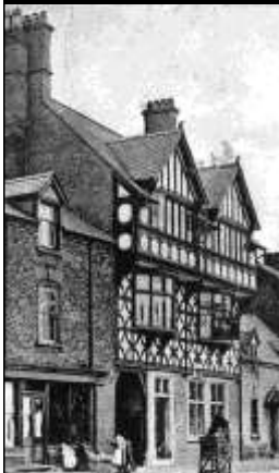
The White Horse in the Edwardian era

I am interested in meeting local people to discuss The White Horse, Overton. I represent Tuns Taverns [ www.tunstaverns.co.uk ] which has purchased the White Horse. It is our intention to invest in the pub and we are interested in hearing from local people.