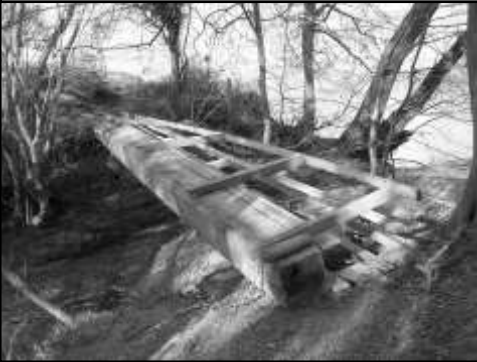
The collapsed Shellbrook Bridge

The Maelor Way is a long distance Public Footpath which runs for 24 miles from Pont Faen near Chirk to Grindley Brook just outside Whitchurch and has been very popular with walkers ever since it opened in April 1991. Sadly, just as the main walking season is about to start, the route has been blocked by two collapsing bridges which, as luck would have it, are both in the Overton area.