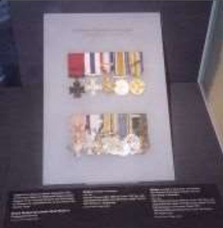
The medals of Noel Godfrey Chavasse