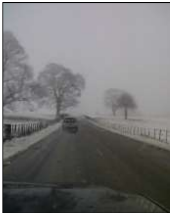
Two contrasting local views in February, taken just a week apart –snow & sunshine