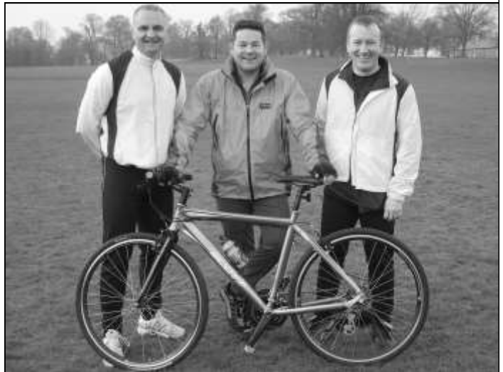
The Overton Fat Bottomed Boys

You can donate on line at www.fatbottomboys.com or by sending your pledge to the school. We may not feel so Fat