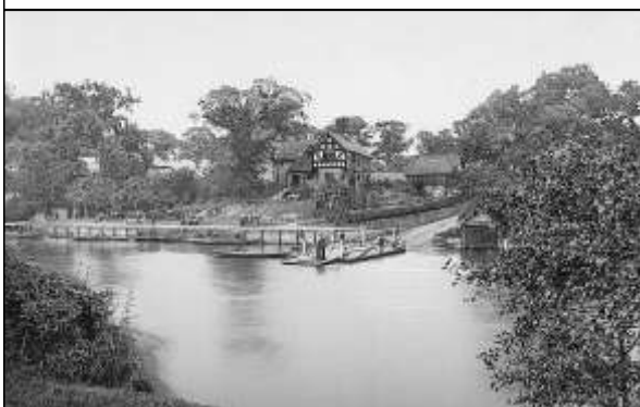
An old postcard of Eccleston Ferry