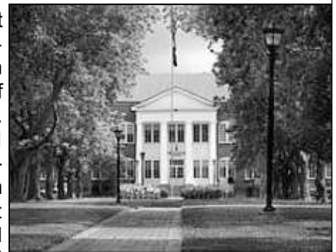
Georgia Southern University

In talking to past G.R.S.P. students, I have found that the host families love to find out anything and everything they can about the countries and towns their students come from and I would like to find as much as I can about not only Wales but Overton too. I am therefore asking if anybody has any information or books or photos or even Overton souvenirs if such things exist! Anything at all that might be of use and I could perhaps take to Georgia to show my host family. This is but a small way of saying thank you to my family and if I have anything to do with it I will hopefully be returning the hospitality if they should ever venture across to "sunny" Welsh shores. I will no doubt keep you posted as time goes on and let you know how everything goes. In the meantime, however, I would be very much grateful of any contributions people could make to my research.