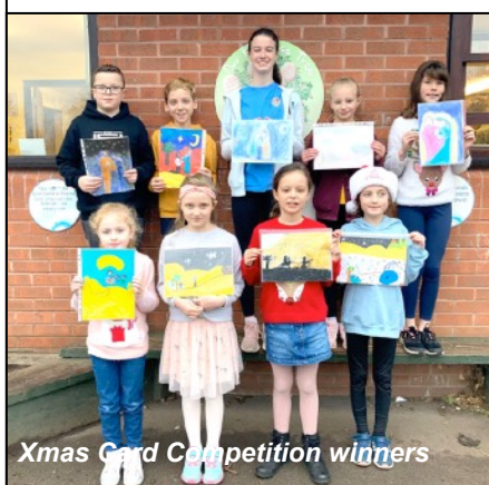
Xmas Card Competition winners