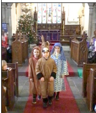
Yrs 1 & 2

This Christmas, we have again scaled back our whole school Christmas show and filmed scenes in our class bubbles on the theme 'Christmas Traditions Across the World' to share with parents, family and friends to watch from the safety and comfort of home. With each class presenting songs and traditions from a range of countries including Mexico and Africa, and ending back here in Britain, it's an informative and fascinating tour of how Christmas is celebrated across the globe.