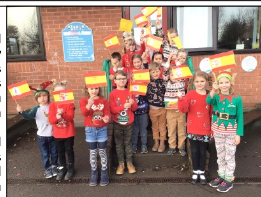
Yrs 1 & 2