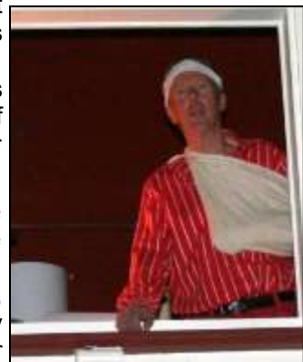
He’s behind you!