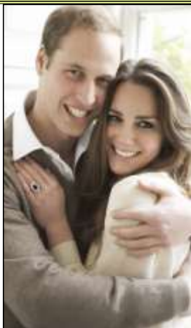
The official engagement photograph of Prince William and Catherine Middleton.

On Friday the 29 th of April the United Kingdom will be celebrating the marriage of Prince William and Kate Middleton. As Overton has been known in the past as a village that really knows how to party, we thought that it would be a great idea to bring the village together to celebrate their special day. The concept of a street party would enable and create a day of fun to remember for all ages.