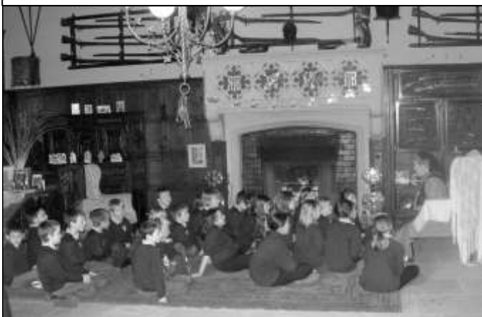
The class listen to a Christmas story in front of the log fire