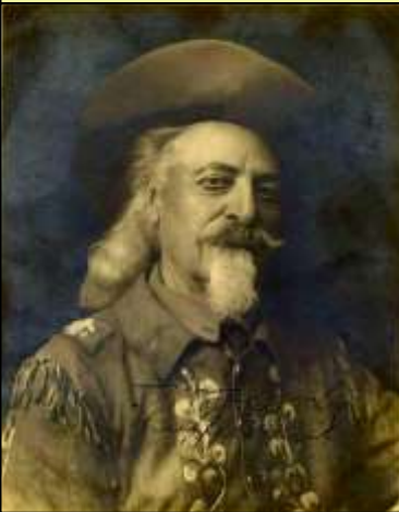
William 'Buffalo Bill' Cody

During the gathering of memories about Wrexham Road at a recent meeting of the History Group, there came to light another famous visitor to Overton.