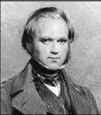
Charles Darwin, the young man

Charles Darwin often stayed with his sister at her home at The Brow, Overton, and no doubt regaled his young nieces and nephews with tales of his famous voyage on the Beagle. Charles was a keen walker, perhaps examining Overton's flora and fauna, and the 1841 census shows us the names of the people he would have met.