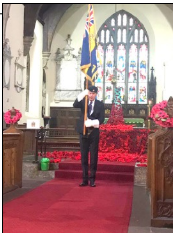
More photos of St Mary's School Remembrance Service