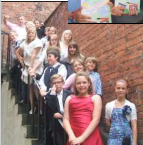
← Year 6 leaving party at the White Horse