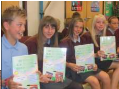
↑ Year 6 with their Records of Achievement

Year 6 pupils at St Mary's school had a very busy last week in primary school. As well as taking part in the grand opening of the historical gardens they also had a leaving service in school where they were presented with their souvenir leaving books courtesy of the P.T.A.. Then to cap it all off they donned their glad rags for a World War II themed leaving party at the White Horse, again organised superbly by the P.T.A. assisted by members of staff.