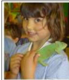
Meeting a chameleon

This term Year 5 has been learning all about Conwy and its castle. So we ventured into Conwy to find out what it is really like. The children were fascinated to find out a plethora of interesting facts about Conwy and thoroughly enjoyed exploring every aspect of this topic. The children were able to look around the town, explore the castle itself, visit the smallest house in Britain, and of course, have time for an ice cream!