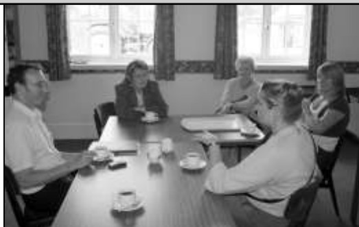
The Calor judges meet members of the village

Overton will receive £1,500 prize money, framed commemorative certificates and a cast iron plaque to be displayed at the approach to the village. If the village goes on to win the overall Wales title there will be an award of a further £1,500 towards community projects.