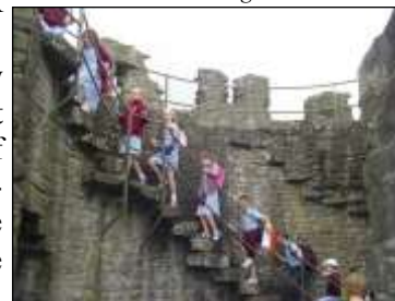
Climbing Conwy Castle