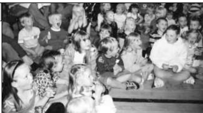
The 40th anniversary celebration playgroup party - July 15th