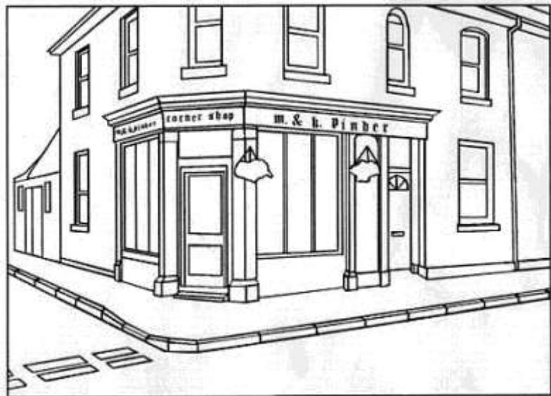
"The Corner Shop"