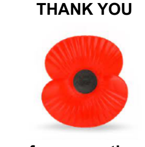
for supporting the Poppy Appeal