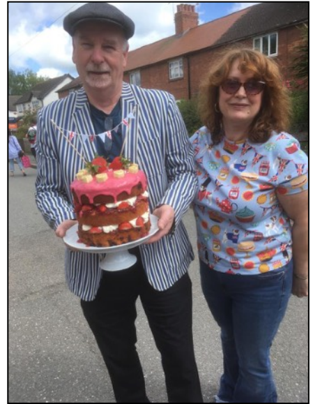
The Coronation Street Party