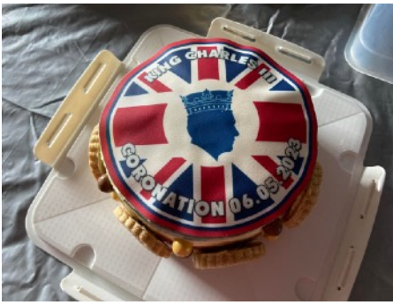
The Recreational Club's Great Overton Bake Off