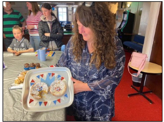
St Mary's School celebrates the Coronation