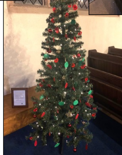
Left: Overton Branch Royal British Legion